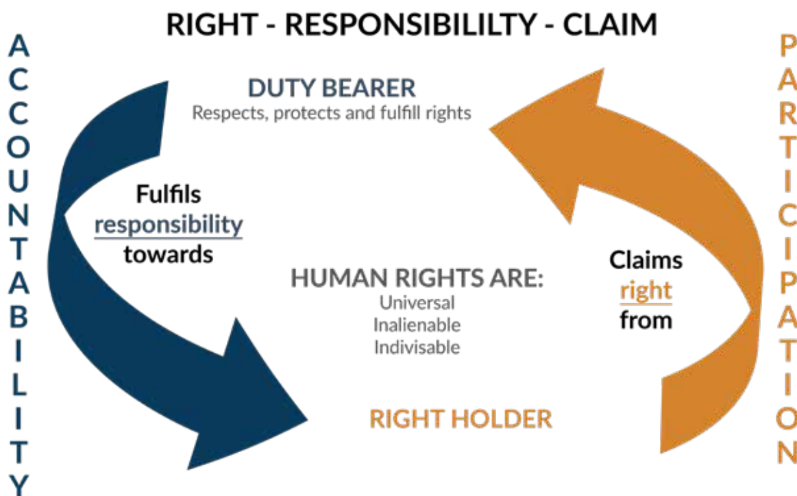
Figure 2: Human rights-based approach

Human rights perspectives are engraved in the South African Constitution. Section 27(1)(b) of the Constitution states that, ‘everyone has the right to have access to sufficient food and water’. This obligation is extended in section 27(2), according to which ‘the state must take reasonable legislative and other measures, within its available resources, to achieve the progressive realisation of each of these rights’. According to the Section 35(2)(e) of the Constitution, prisoners and detainees also have a right to sufficient food, and section 28(1)(c) states that every child has the right to basic nutrition, shelter, basic healthcare services and social services. Based on these provisions, it became important to infuse a human rights-based approach lens to the evaluation to ensure the relevance of evaluation findings and recommendations to policy making.